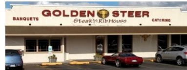
Golden Steer Steak 'n Rib House. 23826 104th Ave SE, Kent, WA 98031

Chapter “V” is now meeting at the Golden Steer Restaurant on the first “Sunday” of the month with breakfast at 09:00am and meeting to follow at 10:00am.